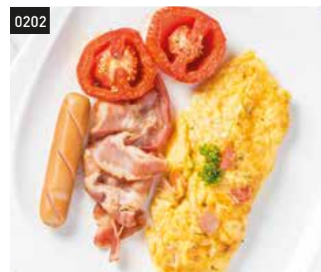
0202 English Breakfast 49,000 K Hot dog, Scrambled Eggs or Omelette Eggs, Bacon, Bread, Butter and Jam. Choice of Drink (Americano Coffee or Tea)