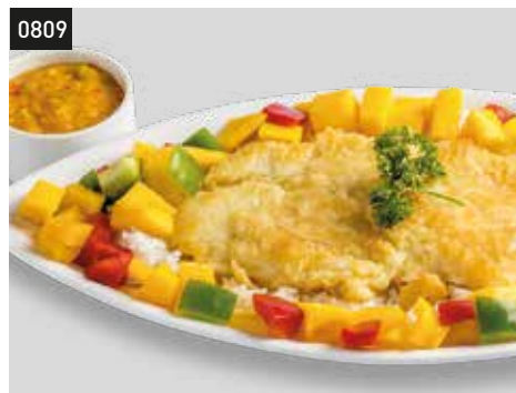
0809 Mango Salsa Fish 59,000 K Pan Fried Fish with Mango Salsa and Rice