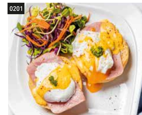
0201 Eggs Benedict 45,000 K Poached Eggs and Ham on Toasted Bun with Hollandaise Sauce