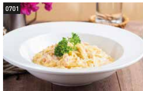
0701 Carbonara 45,000 K Pasta with Ham and Cream Sauce