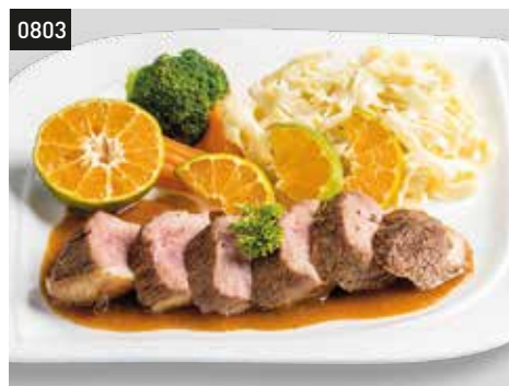
0803 Canard à l'Orange 69,000 K Duck Breast and Orange Sauce