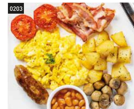
0203 American Breakfast 65,000 K Sausage, Scrambled Eggs or Omelette Eggs, Bacon, Mushrooms, Potatoes, Tomatoes, Red Beans, Bread, Butter and Jam. Choice of Drink (Americano Coffee or Tea)