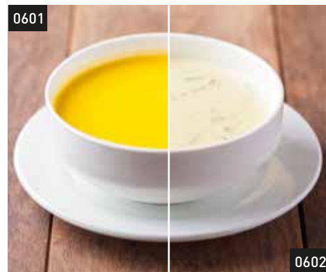
0601 Cream of Pumpkin Soup 38,000 K