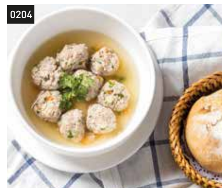
0204 Lao Breakfast 45,000 K "Siew Mai": Soup of Pork Balls, and Bread. Choice of Drink (Americano or Tea)