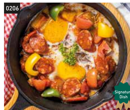
0206 Spanish Hot Plate 45,000 K Slow Cooked Eggs in Ratatouille Sauce with Chorizo