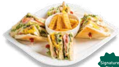
0315 Sinouk Club Sandwich Grilled Chicken, Ham, Boiled Egg, Salad, Tomato, Cucumber and Savoury Sauce in Toasted Bread with French Fries 45,000 K