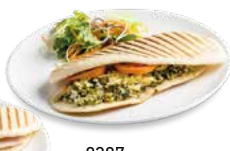
0307 Panini Pesto Pesto Sauce, Cheese and Tomato 33,000 K