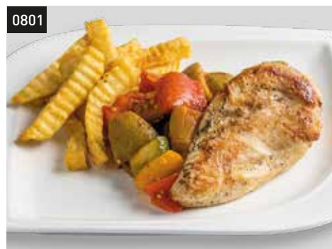
0801 Provençale Chicken Breast 59,000 K Chicken with Ratatouille Sauce