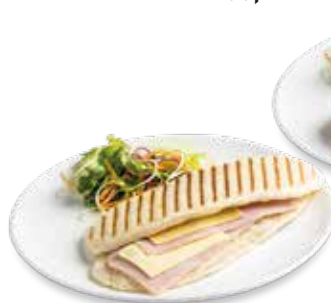
0309 Panini Ham & Cheese Ham and Cheese 35,000 K