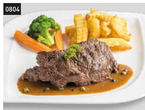
0804 Beef Steak 79,000 K Beef and Pepper Sauce