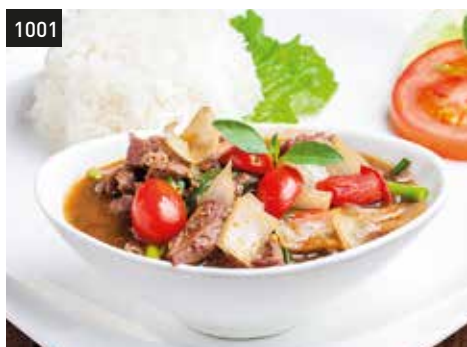
1001 Stir Fried Beef with Onions 35,000 K ຜັດຊີ້ນງົວ ທອມບົວໃຫຍ່