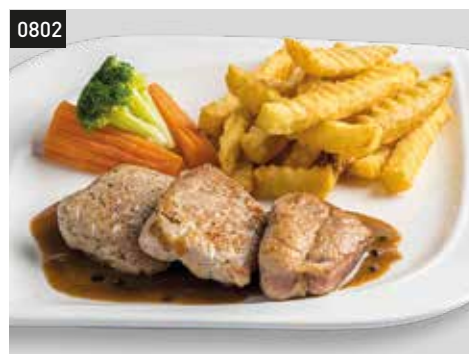
0802 Pork Filet Mignon 65,000 K Pork Tenderloin and Pepper Sauce