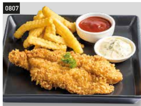
0807 Fish & Chips 59,000 K Crispy Fish with French Fries and Homemade Tartare Sauce