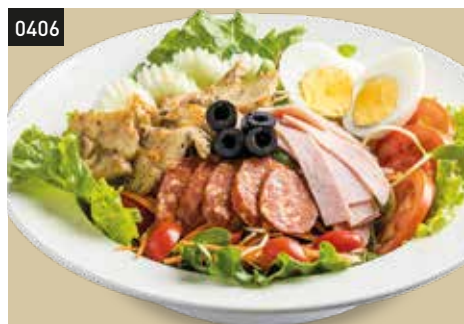
0406 Chef Salad 49,000 K Grilled Chicken Bites, Chorizo, Ham, Egg, Salad, Tomato, Cucumber, Carrot Red Cabbage and Black Olive