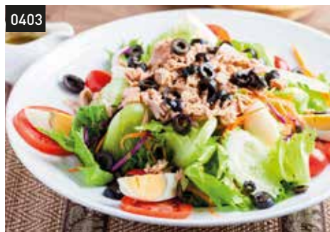
0403 Crispy Chicken Salad 49,000 K Fried Chicken, Salad, Tomato, Cucumber, Carrot and Red Cabbage