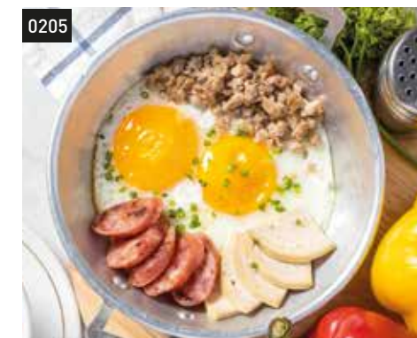
0205 Vietnamese Breakfast 49,000 K Fried Eggs in Vietnamese Pan, Minced Pork, Sausage Slices and Bread. Choice of Drink (Americano or Tea)