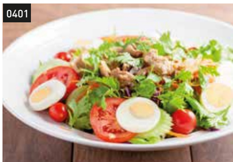
0401 Lao Salad 45,000 K Pork, Egg, Salad, Tomato, Cucumber, Carrot, Red Cabbage with Egg Yolk Sauce