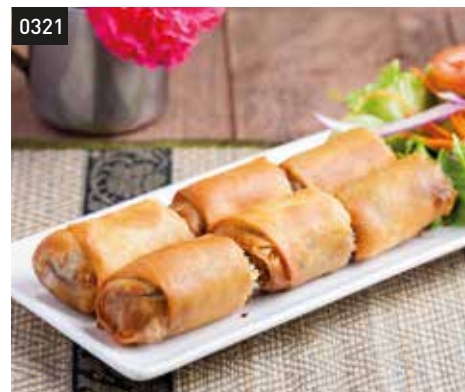
1018 Fried Spring Rolls with Minced Pork Fillings 29,000 K