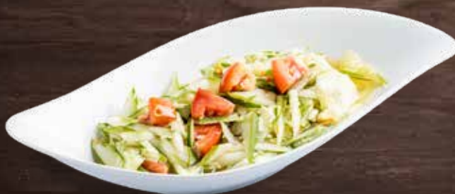
1521 Spicy Cucumber Salad 20,000 K ຕຳໝາກແຕງ