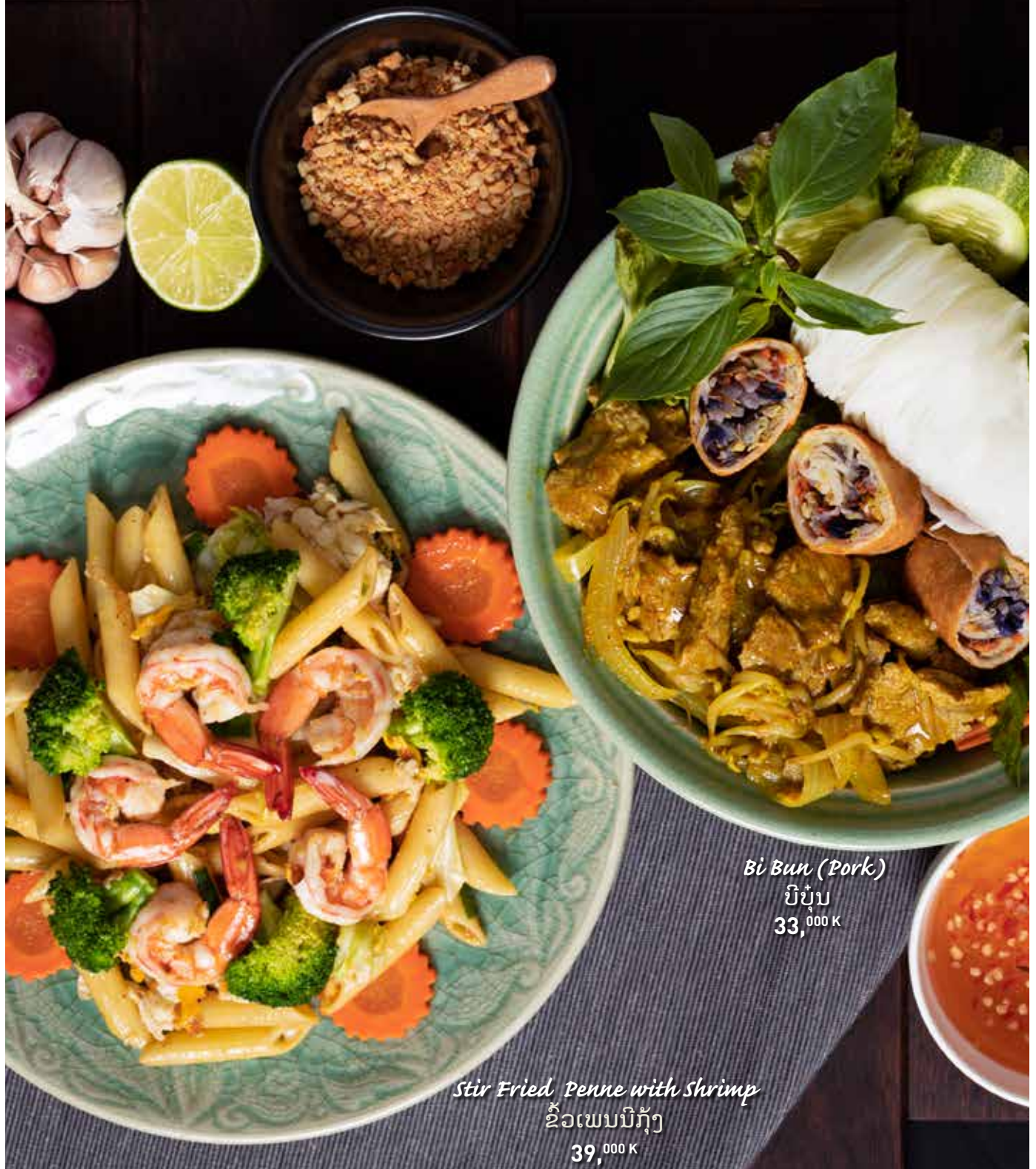
Bi Bun (Pork)