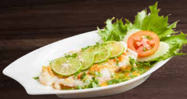
1515 Steamed Fish with Spicy Lemon Sauce 55,000 K ປານັ່ງໝາກນາວ