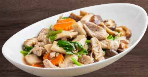
1513 Stir Fried 3 Kinds of 45.000 K Mushrooms with Chicken ໄກ່ຜັດເຫັດ 3 ຢ່າງ