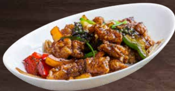
1507 Black Pepper 49.000 K Stir Fried Fish with Onions ປາຜັດພິກໄທຕໍ່າ