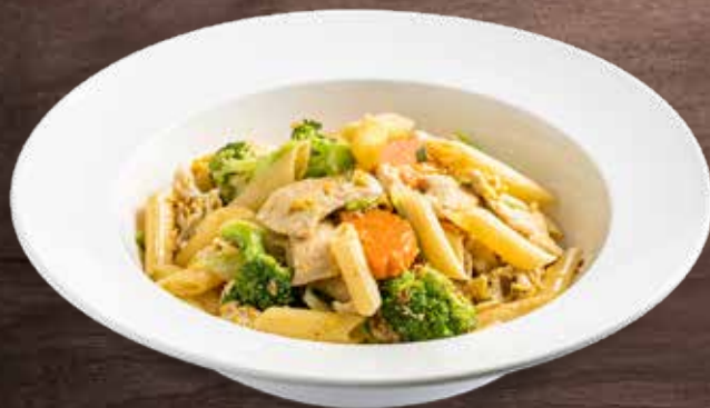
1012 Stir Fried Penne 33,000 K with Chicken or Pork 33,000 K with Beef or Shrimp 39,000 K ຂົ້ວເພນນີໄກ່ ຫຼື ໝູ ຫຼື ງົວ ຫຼື ກຸ້ງ