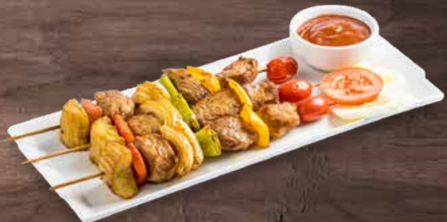
1520 Chicken or Pork BBQ 35,000 K ບາບີຄິວໄກ່ ຫຼື ໝູ່