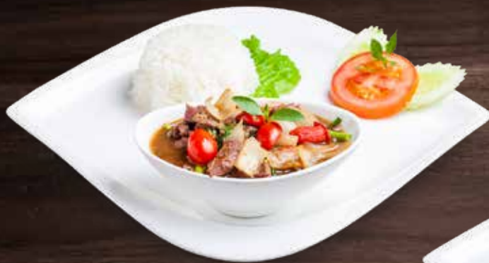
1001 Stir Fried Beef 39,000 K with Onions ຜັດຊີ້ນງົວ ຫອມປົ່ວໃຫຍ່