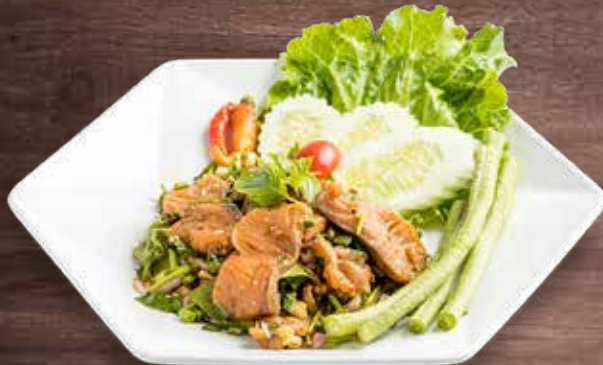
1517 Larb Salmon 65,000 K ປາປາແຊວມ່ອນ