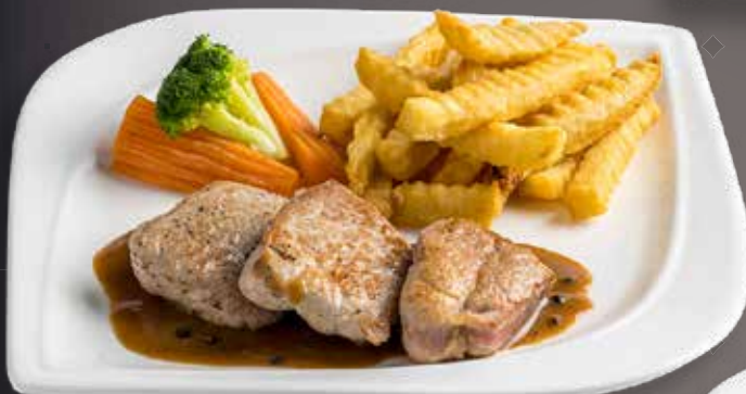
0802 Pork Filet Mignon 65.000 K

Chicken with Ratatouille Sauce (Zucchini, Bell Pepper, Eggplant, Tomato and Onion)