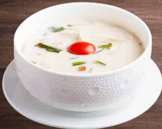
1503 Tom Kha Kai 45,000 K Thai Sour and Spicy Chicken Soup in Coconut Milk ຕົ້ມຂ່າໄກ່