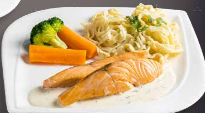
0805 Salmon Steak 89.000 K