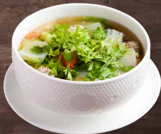
1506 Seaweed Vegetables 39,000 K Soup with Minced Pork ແກງຈິດສາຫຼ້າຍໝູສັບ