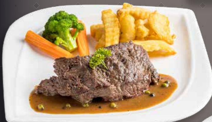
0804 Beef Steak 79.000 K