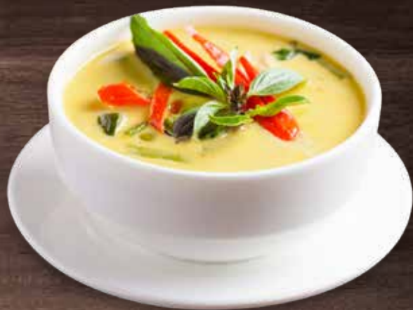
1502 Kaeng Khiew Warn 45,000 K Chicken or Pork Green Curry with Chicken or Pork ແກງຂຽວຫວານໄກ່ ຫຼື ໝູ