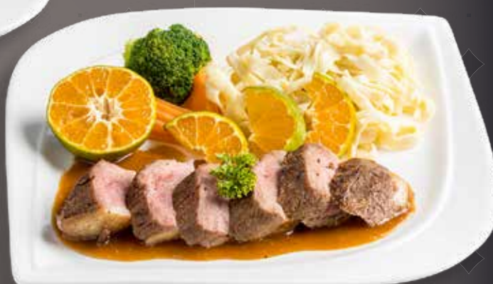
0803 Canard à l'Orange 69.000 K