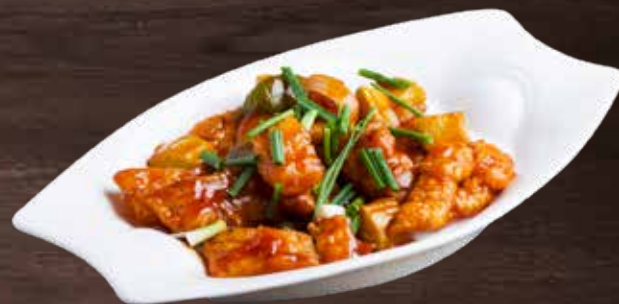
1508 Pad Piew Warn 49.000 K with Pork or Fish Sweet and Sour Pork or Fish ຜັດປັ້ງວຫວານ ໝູ ຫຼື ປາ