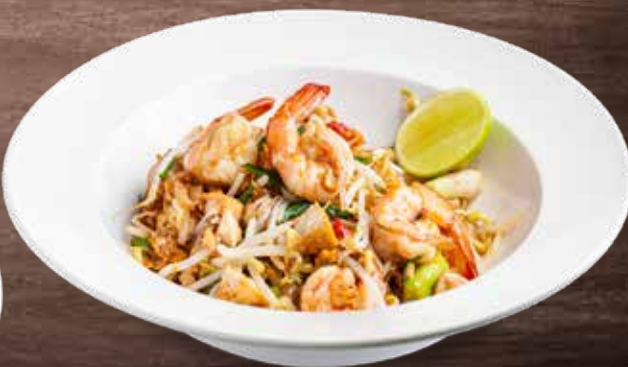
1011 Pad Thai with Chicken or Pork 33,000 K with Shrimp 39,000 K ຜັດໄທໄກ່ ຫຼື ໝູ ຫຼື ກຸ້ງ