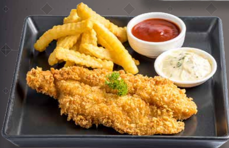
0807 Fish & Chips 59.000 K Crispy Fish with French Fries and Homemade Tartare Sauce