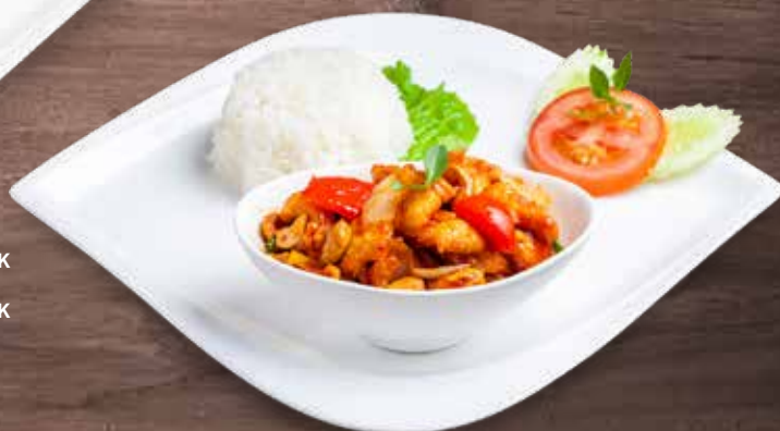
1004 Stir Fried Chicken 35,000 K with Cashew Nuts ຜັດໄກ່ ເມັດໝາກມ່ວງ