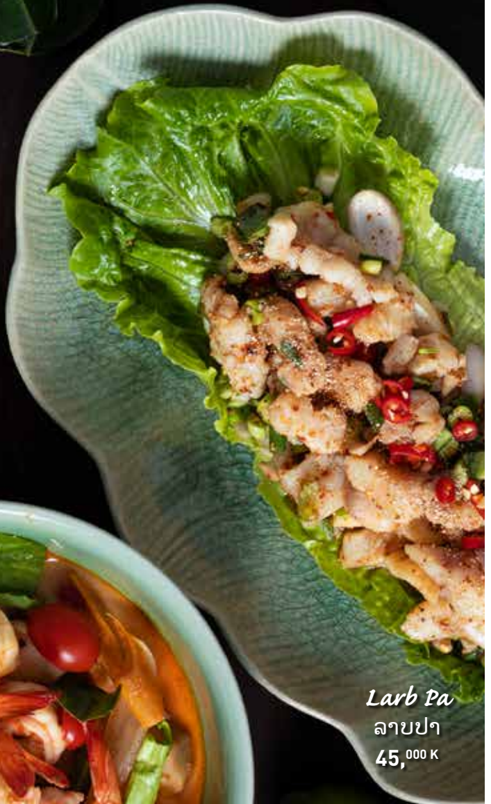
Larb Pa ລາບປາ 45,000 K