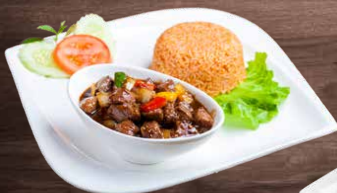
1005 Loc Lac Beef 45,000 K ລຸກ ລັກ ງົວ