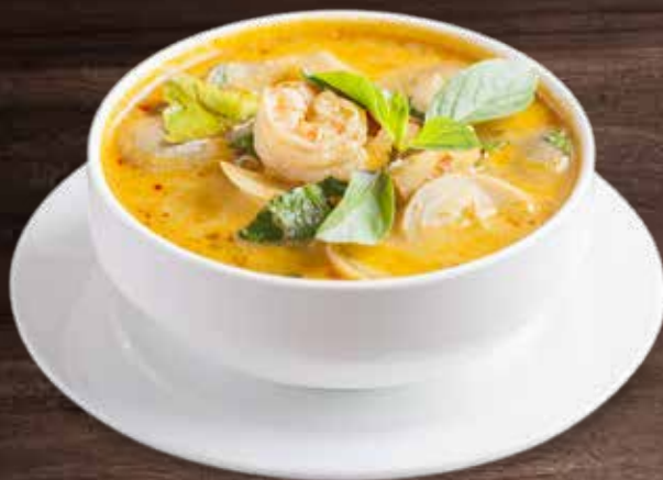
1501 Tom Yum Chicken 45,000 K or Shrimps or Fish 49,000 K Thai Sour and Spicy Soup with Chicken or Shrimps or Fish ຕົ້ມຍ່າໄກ່ ຫຼື ກຸ້ງ ຫຼື ປາ