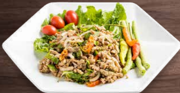
1519 Lao Larb Moo Ped or Pa 45,000 K ປາປາແຊວມ່ອນ ຫຼື ເປັດ ຫຼື ປາ