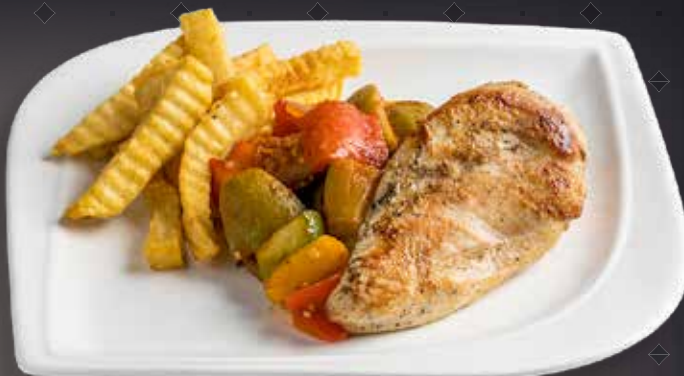
0801 Provençale Chicken Breast 59.000 K

Chicken with Ratatouille Sauce (Zucchini, Bell Pepper, Eggplant, Tomato and Onion)