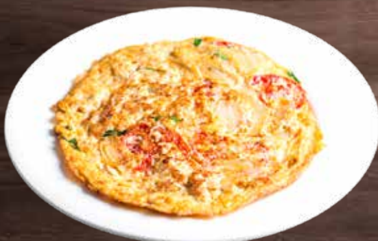
1505 Lao Style Omelette 25,000 K with minced Pork and Tomato slice ໄຂ່ຈຽວໝູສັບ