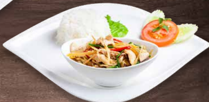
1002 Stir Fried Chicken 33,000 K with Ginger ໄກ່ຜັດຂົງ