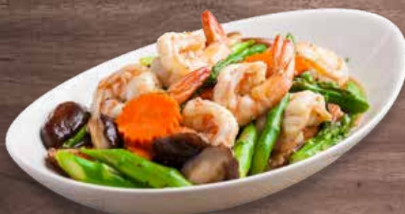
1511 Stir Fried Shrimps 49.000 K with Asparagus ຜັດກັງສິດໝໍ້ມ້ຝຣັ່ງ