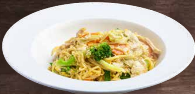
1008 Stir Fried Yellow Noodles 33,000 K with Chicken or Pork with Beef or Shrimp 39,000 K ຂົ້ວມີເຫຼືອງໄກ່ ຫຼື ໝູ ຫຼື ງົວ ຫຼື ກຸ້ງ