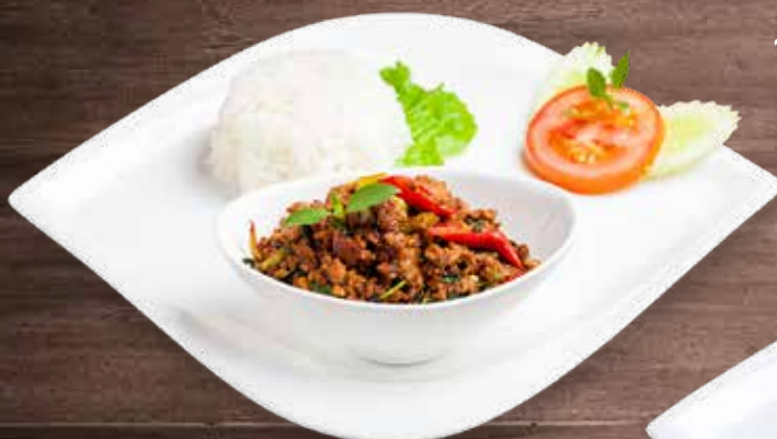
1003 Kaphao Pork or Chicken 33,000 K with Beef or Shrimp 39,000 K Stir Fried Meat with Basil Leaves ຜັດກະເພົາໄກ່ ຫຼື ໝູ ຫຼື ງົວ ຫຼື ກຸ້ງ