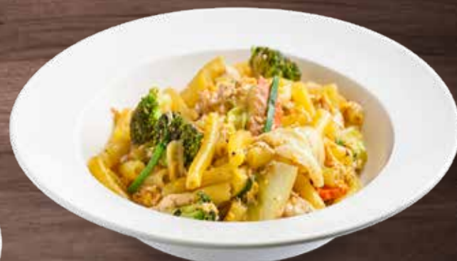
1009 Stir Fried Macaroni 33,000 K with Chicken or Pork with Beef or Shrimp 39,000 K ຂົ້ວມາກາໂຣນີໄກ່ ຫຼື ໝູ ຫຼື ງົວ ຫຼື ກຸ້ງ