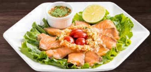
1516 Salmon Sae Num Pa 59,000 K ປາແຊວມ່ອນ ແຊ່ນນ້ຳປາ