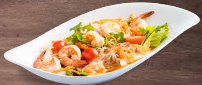
1518 Spicy Vermicelli Salad with Shrimps and Minced Pork 49,000 K ຍຳວຸ້ນເສັ້ນກຸ້ງສິດ ແລະ ໝູ່ສັບ