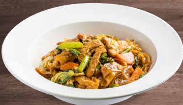
1010 Stir Fried Noodles 33,000 K with Chicken or Pork with Beef or Shrimp 39,000 K ຂົ້ວເຝີເສັ້ນໃຫຍ່ໄກ່ ຫຼື ໝູ ຫຼື ງົວ ຫຼື ກຸ້ງ