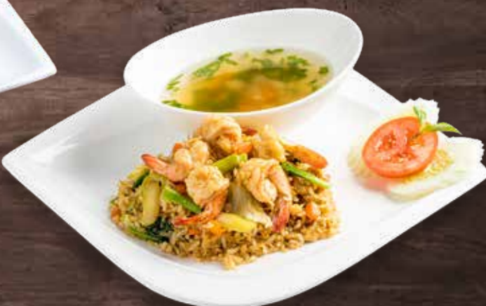
1006 Chicken or Pork Fried Rice 33,000 K with Beef or Shrimp 39,000 K ເຂົ້າຜັດໄກ່ ຫຼື ໝູ ຫຼື ງົວ ຫຼື ກຸ້ງ