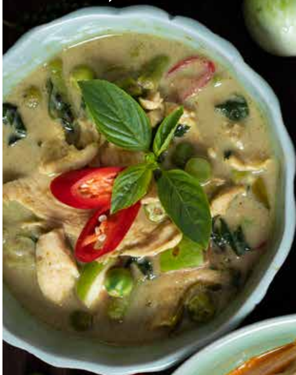
Green Curry ແກງຊຽວຫວານໄກ່ 45,000 K