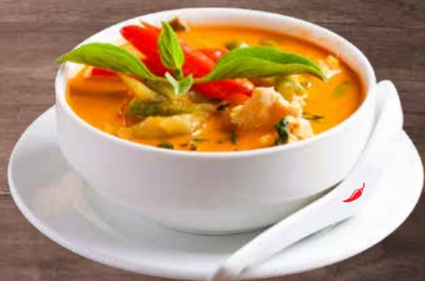
1504 Kaeng Phet Chicken 45,000 K or Pork Spicy Red Curry with Chicken or Pork ແກງເຜັດໄກ່ ຫຼື ໝູ