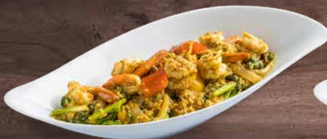
1509 Stir Fried Curry 59.000 K Prawns with Onions ກັງຜັດຜົງກະຫຼີ