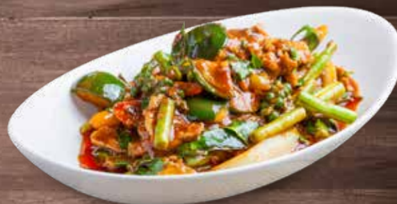
1512 Pad Phik Kaeng 45.000 K Chicken or Pork 49.000 K Shrimps Stir Fried Chicken or Pork or Shrimp in Chilli Paste ຜັດພິກແກງໄກ່ ຫຼື ໝູ ຫຼື ກັງ